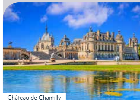
Château de Chantilly