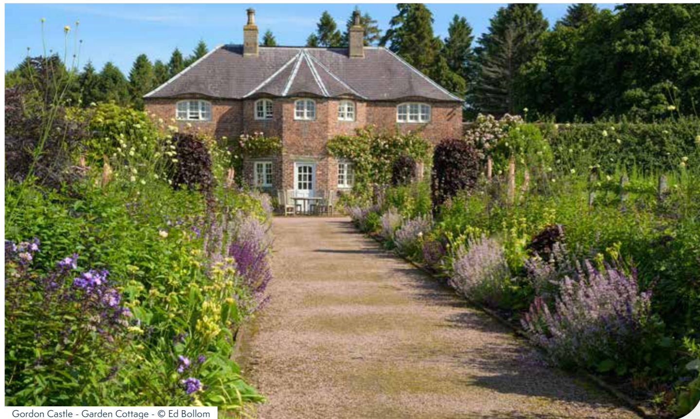
Gordon Castle - Garden Cottage