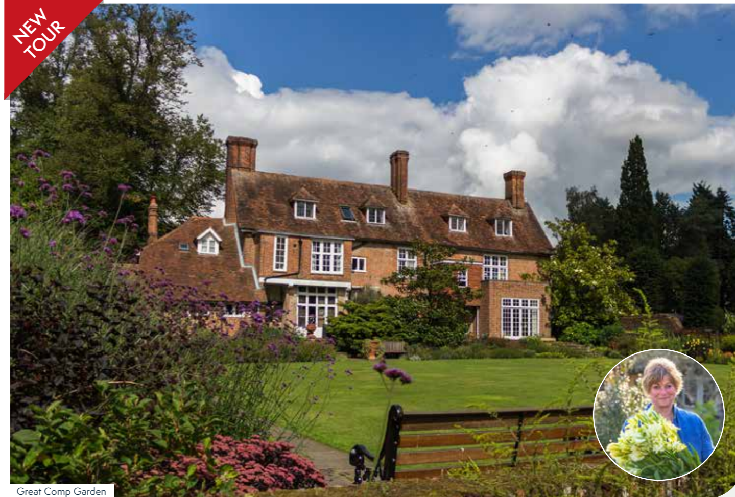
Great Comp Garden