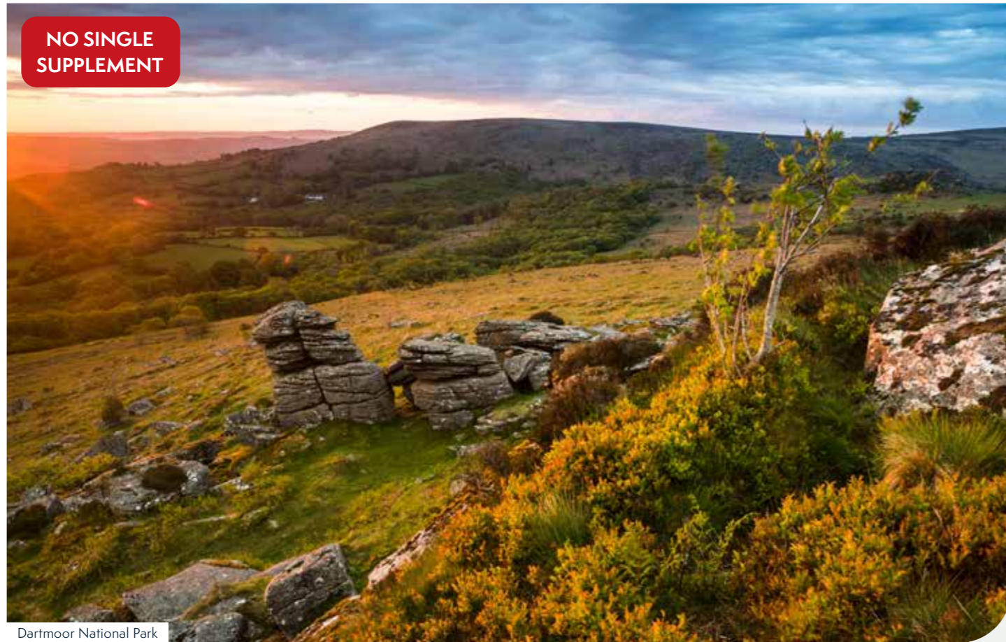
Dartmoor National Park