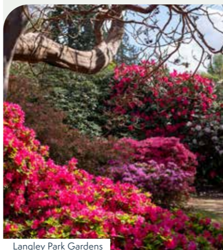
Langley Park Gardens