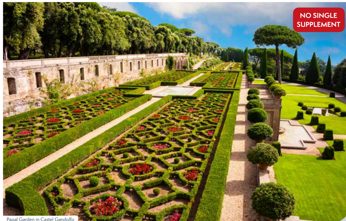
Papal Garden in Castel Gandolfo