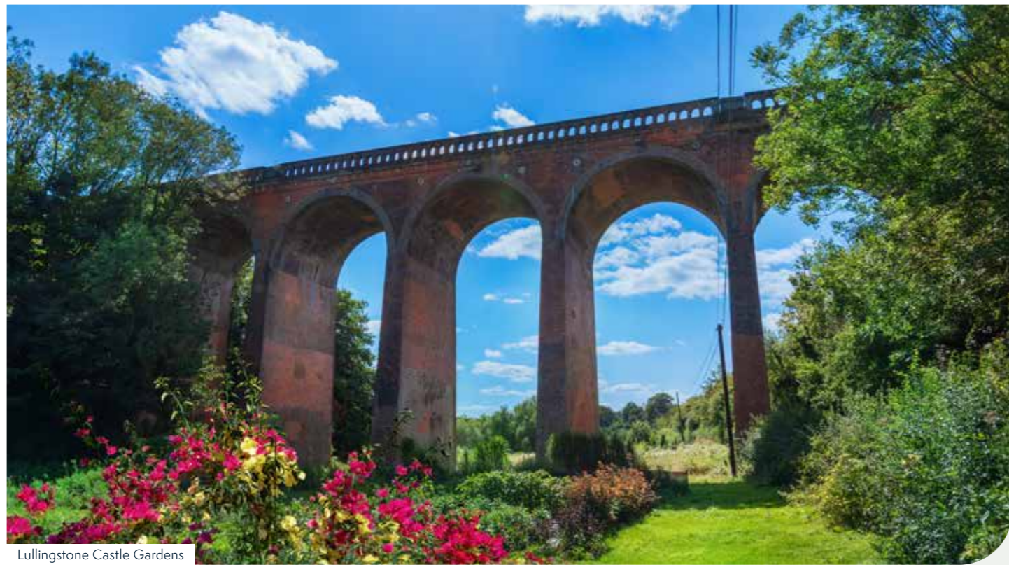
Lullingstone Castle Gardens