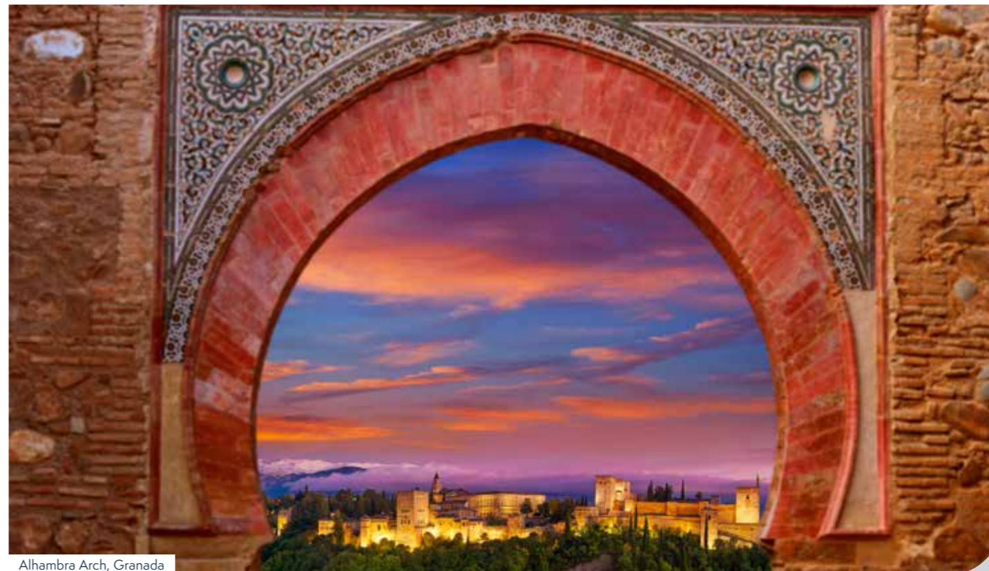
Alhambra Arch, Granada