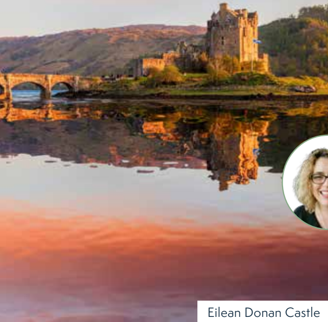
Eilean Donan Castle