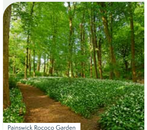
Painswick Rococo Garden