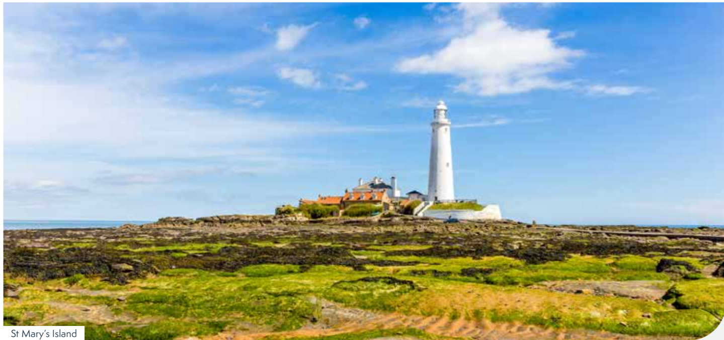
St Mary's Island