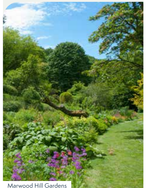
Marwood Hill Gardens