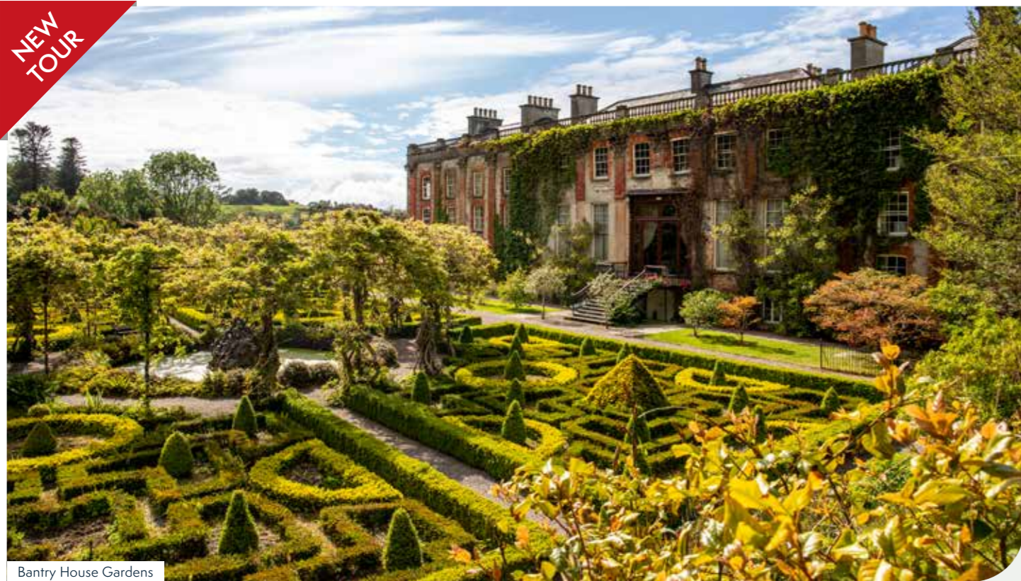
Bantry House Gardens