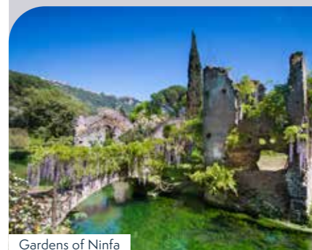
Gardens of Ninfa