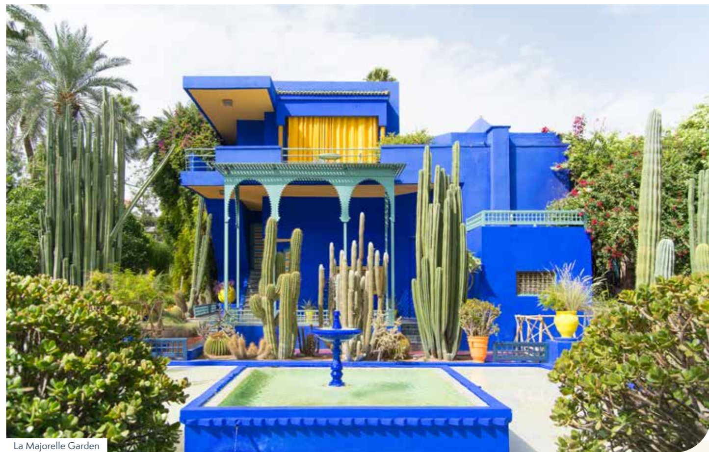
La Majorelle Garden