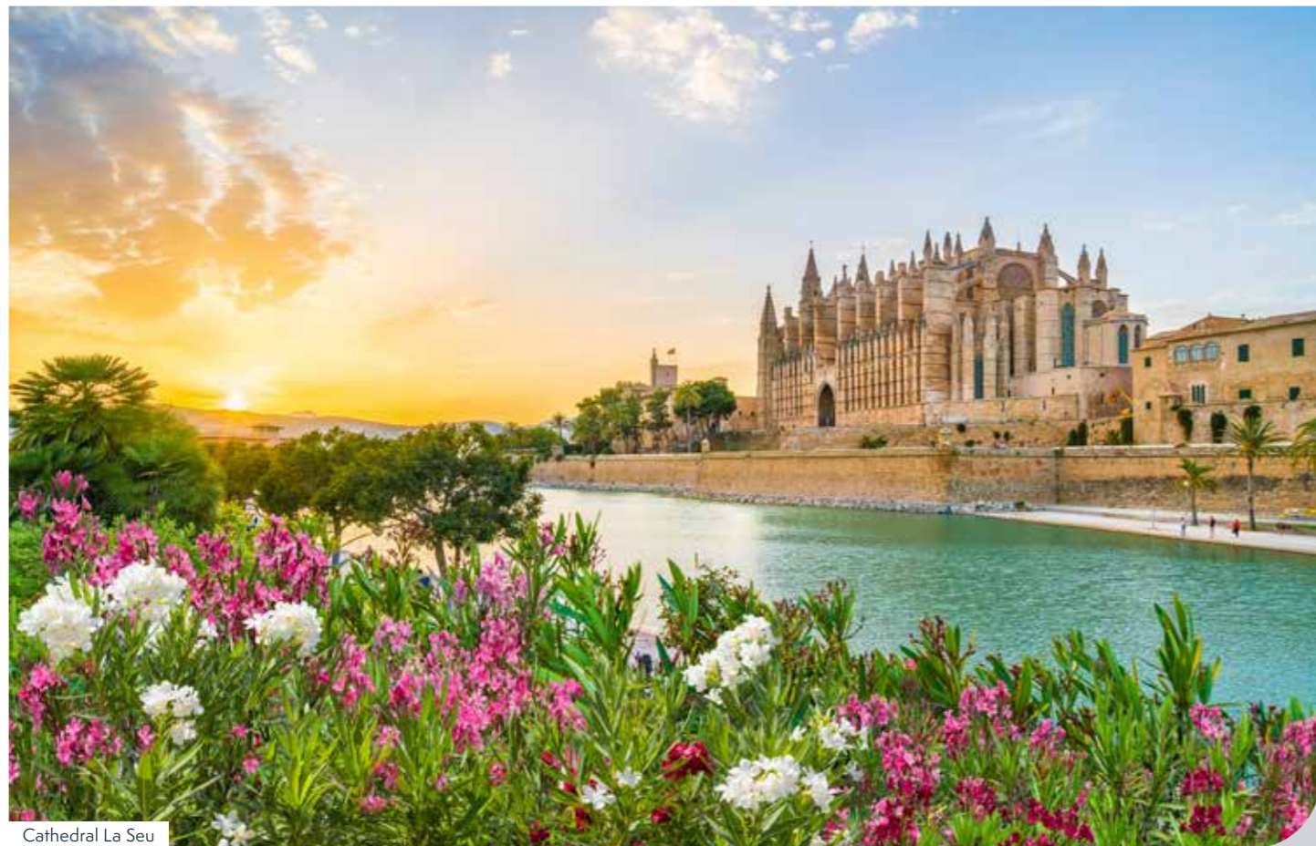
Cathedral La Seu