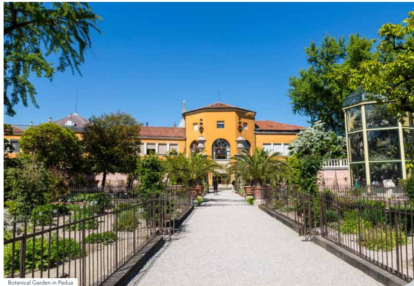
Botanical Garden in Padua