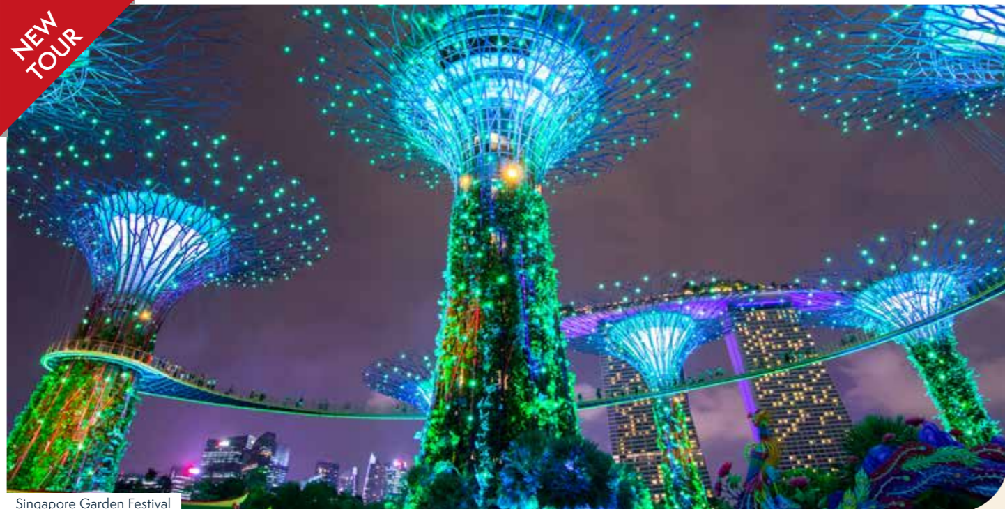
Singapore Garden Festival