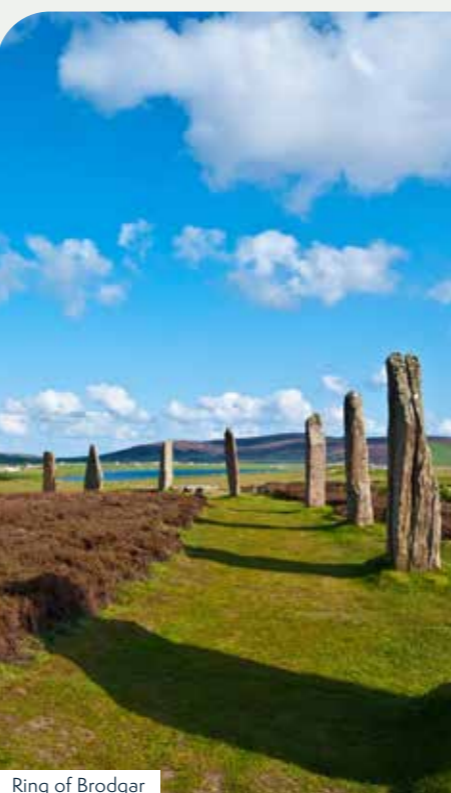
Ring of Brodgar