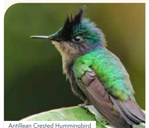
Antillean Crested Hummingbird