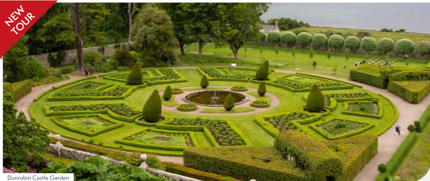
Dunrobin Castle Garden