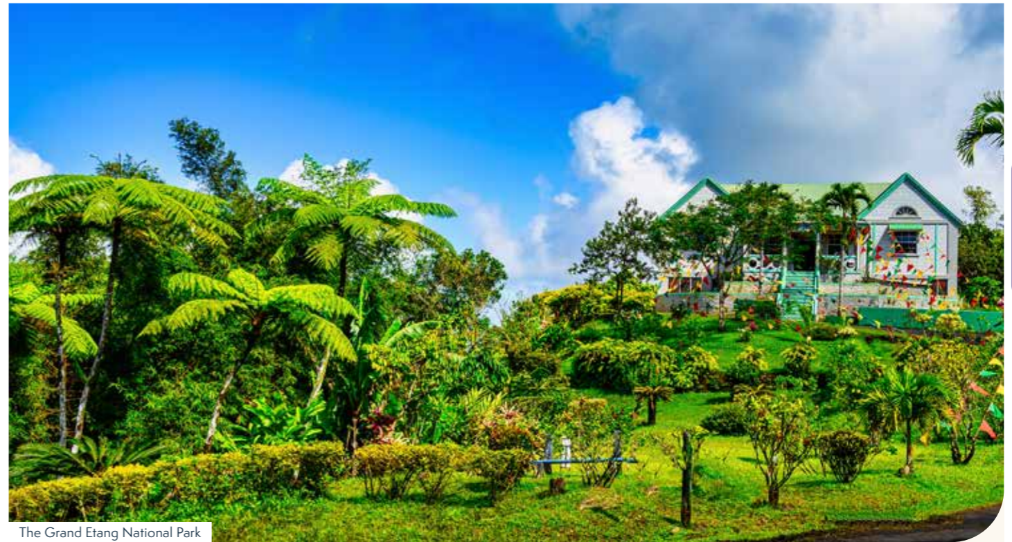
The Grand Etang National Park