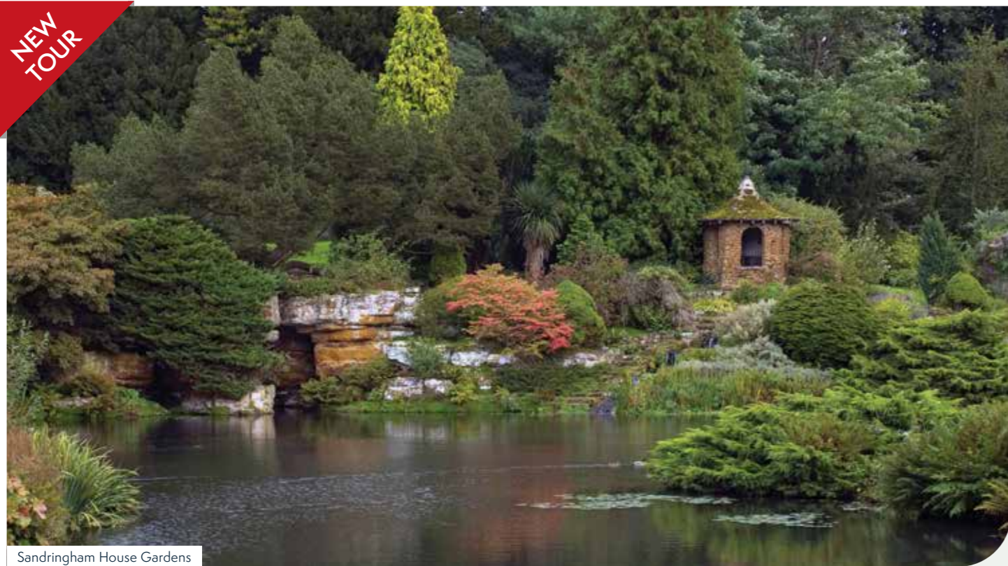
Sandringham House Gardens