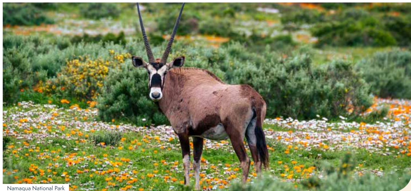
Namaqua National Park