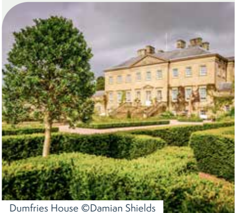
Dumfries House