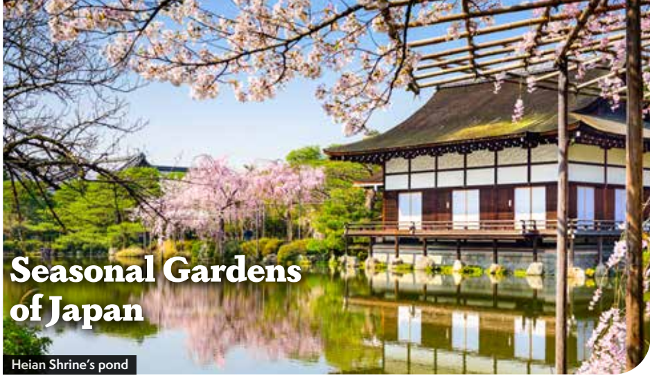
Heian Shrine's pond

9 DAYS from $2,585 $2,095 | NO SINGLE SUPPLEMENT ✈️ DEPARTURE POINT: London 📅 DEPARTURE: 16 - 24 Apr