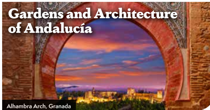
Alhambra Arch, Granada

Andalucía is unrivalled in Europe for its wealth of history, culture, Moorish architecture and gardens, all set against the backdrop of the snow-capped mountains. Visit the classical gardens which complement the adjoining palaces and churches perfectly and discover the wild landscapes here.