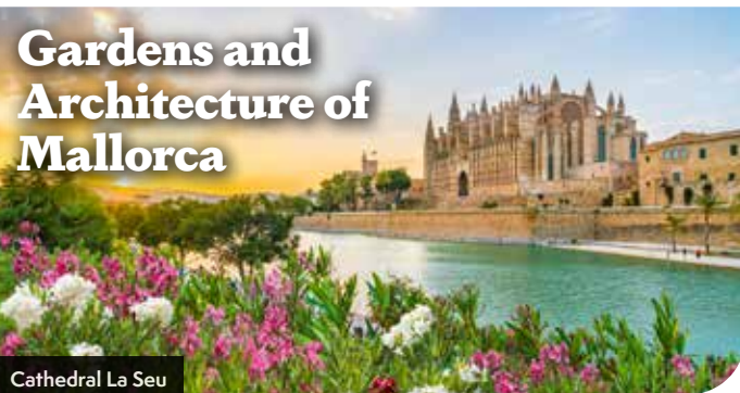
Cathedral La Seu

The Balearic Island of Mallorca offers a timeless landscape of wooded hills, orange groves, sweeping bays and rocky mountains as well as a host of beautiful gardens. We visit several of these, discover the monastery of Real Cartuja de Valldemosa, tour the city of Palma, the Jardines de Alfabia, set in the Tramuntana Mountains and take an exhilarating ride on the Tren de Soller.