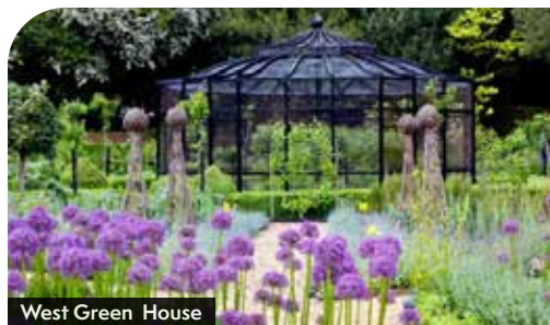
West Green House

This exceptional springtime tour combines the vibrancy of the RHS Chelsea Flower Show with visits to Southern England's most enchanting gardens. Travelling through Cornwall, Devon, Somerset, Hampshire, Surrey, and Kent, we explore both hidden treasures and world-famous sites. Highlights include an early visit to Sissinghurst, a guided tour of Hestercombe Gardens by Gertrude Jekyll and Sir Edwin Lutyens, and an extended exploration of RHS Garden Wisley with its extraordinary plant collections. Expect a feast for the senses: contemporary sculptures, imaginative design, medieval layouts, Japanese-inspired features, tranquil lakes, sub-tropical foliage, and brilliant seasonal displays of azaleas, peonies, wisteria, and rhododendrons.