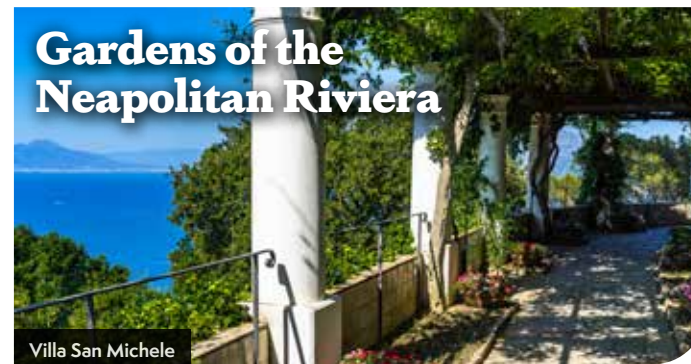
Villa San Michele

Discover Southern Italy's vibrant heritage and lush landscapes, where fertile soil nurtures citrus groves, vineyards, and sublime gardens. Visit Ischia's La Mortella, William Walton's exotic haven, the Amalfi coast's Villa Rufolo and Villa Cimbrone in Ravello, and remarkable Pompeii—each revealing the region's timeless beauty, history, and Mediterranean splendour.