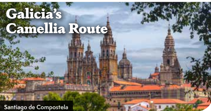
Santiago de Compostela

In Galicia's lush, rain-kissed landscape, camellias bloom brilliantly in shades of pink, white and red. Following the Camellia Route from La Coruña to Vigo, we visit elegant pazos and gardens – including the magnificent Castillo de Soutomaior – where these exquisite flowers bring spring colour to Spain's verdant northwest.