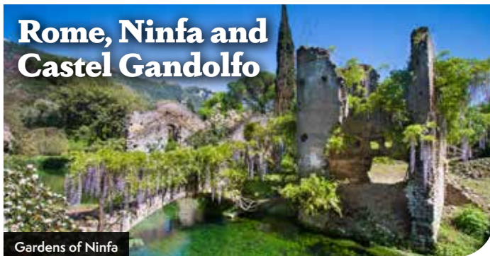
Gardens of Ninfa

Open by special arrangement, this exclusive visit offers the chance to explore the exquisite gardens of Ninfa, where roses, hydrangeas, and jasmines drape medieval ruins beside a crystal-clear river. Continue to the gardens of Castel Gandolfo, the historic papal residence near Rome, and walk in the footsteps of Popes amid serene, beautifully landscaped grounds.