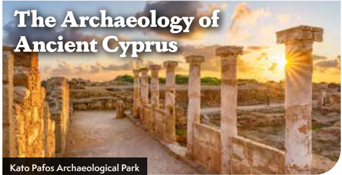
Kato Pafos Archaeological Park

Cyprus, rich in Prehistoric, Classical, and Medieval heritage, reveals over 10,000 years of culture through unique artefacts, architecture, and art. In mild spring weather, explore UNESCO sites like Khirokitia and Paphos's Archaeological Park and Tomb of the Kings, plus Aphrodite's legendary birthplace and many other fascinating locations.