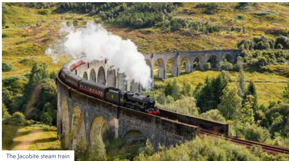
The Jacobite steam train