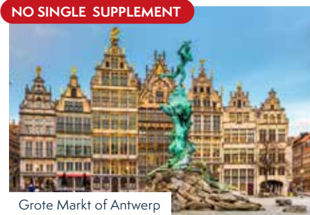
Grote Markt of Antwerp