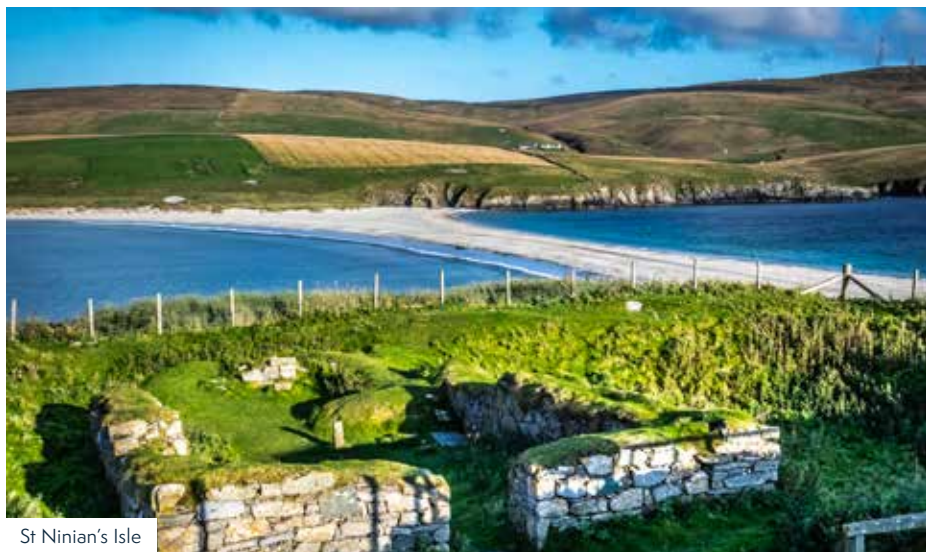
St Ninian's Isle