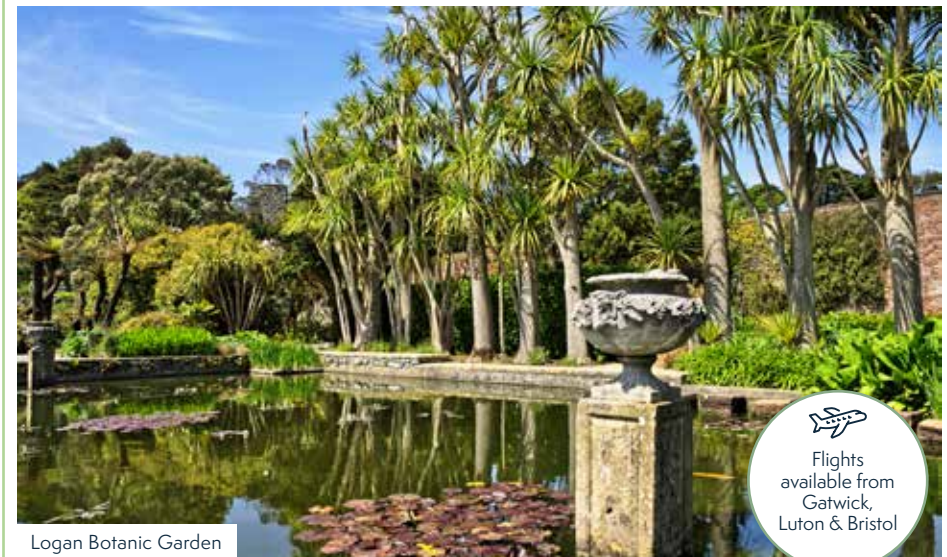
Logan Botanic Garden

Flights available from Gatwick, Luton & Bristol