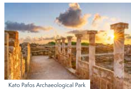
Kato Pafos Archaeological Park