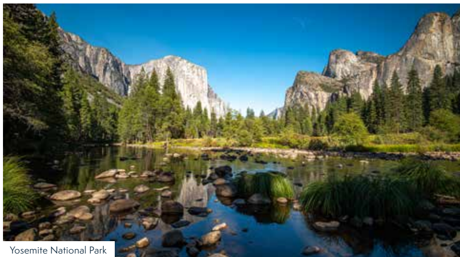
Yosemite National Park