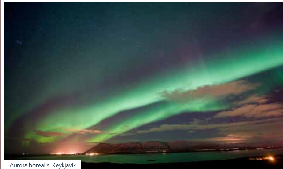
Aurora borealis, Reykjavik