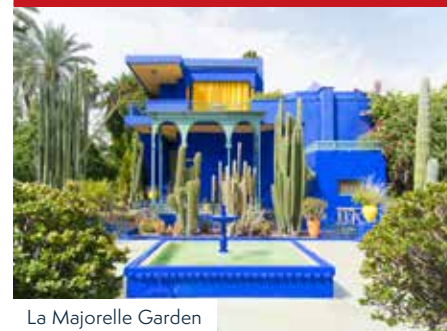
La Majorelle Garden