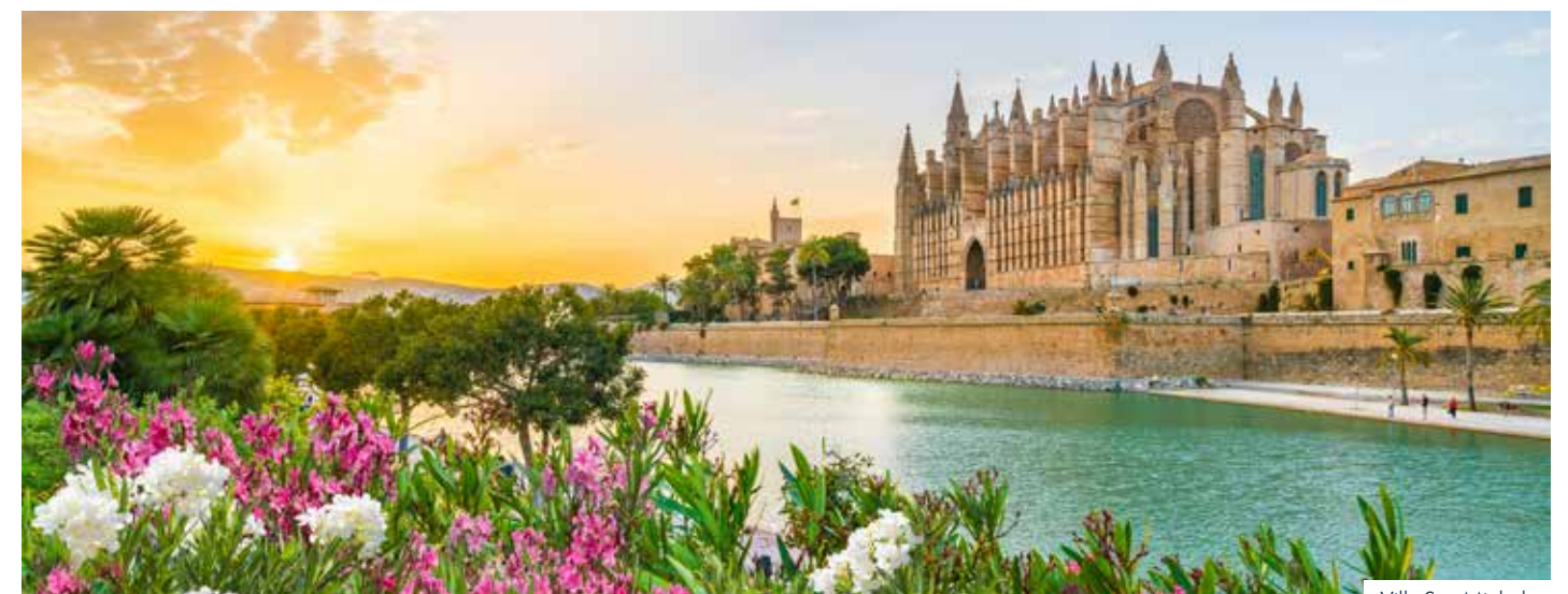
Villa San Michele