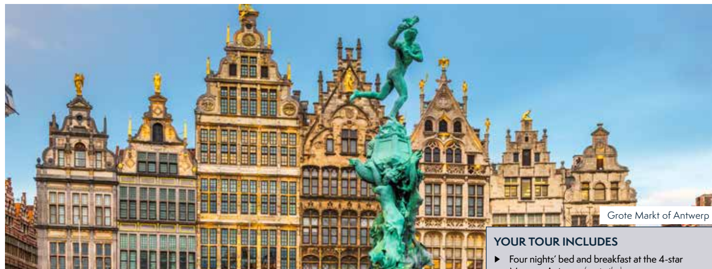
Grote Markt of Antwerp

Seaview Room Supplement £75 Optional Excursion: Gozo £145