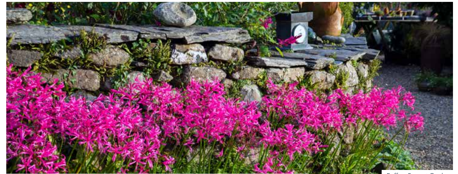
Dyffryn Fernant Garden

Please note: The order of the itinerary may change due to Lindisfarne tides.