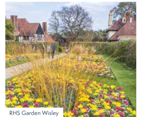
RHS Garden Wisley