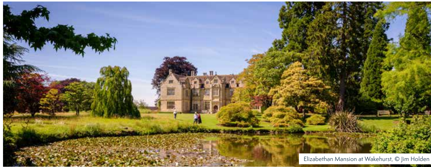
Elizabethan Mansion at Wakehurst