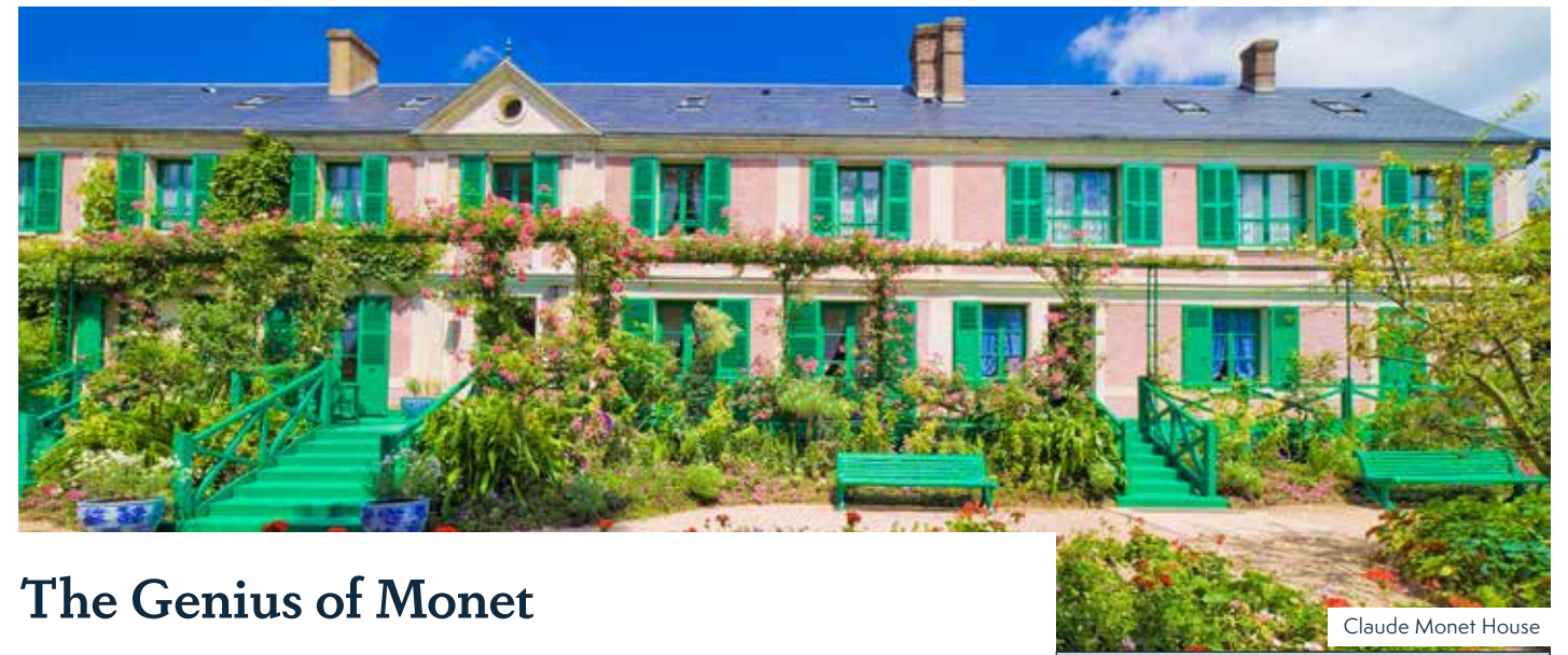
Claude Monet House