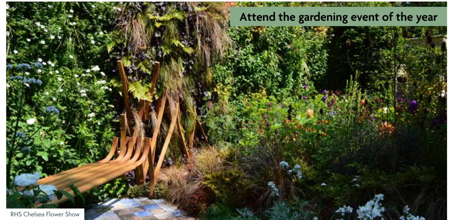
RHS Chelsea Flower Show