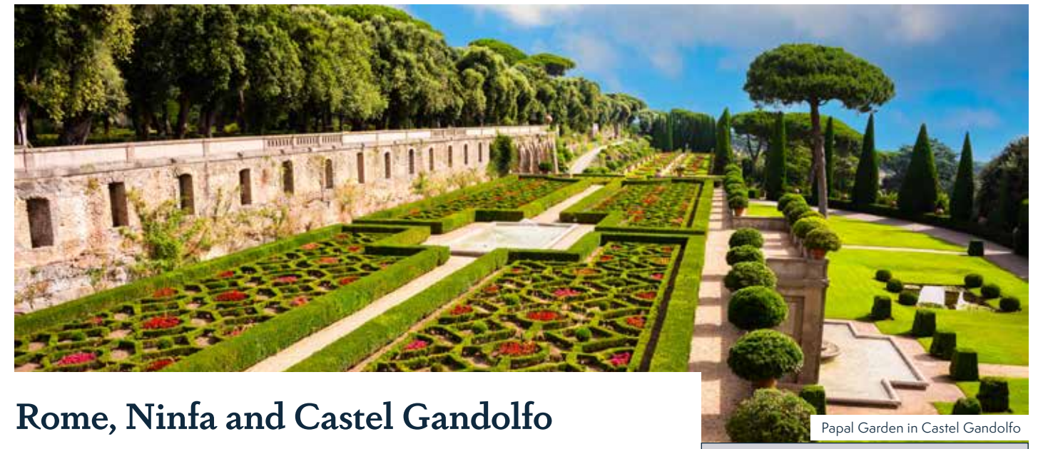
Papal Garden in Castel Gandolfo