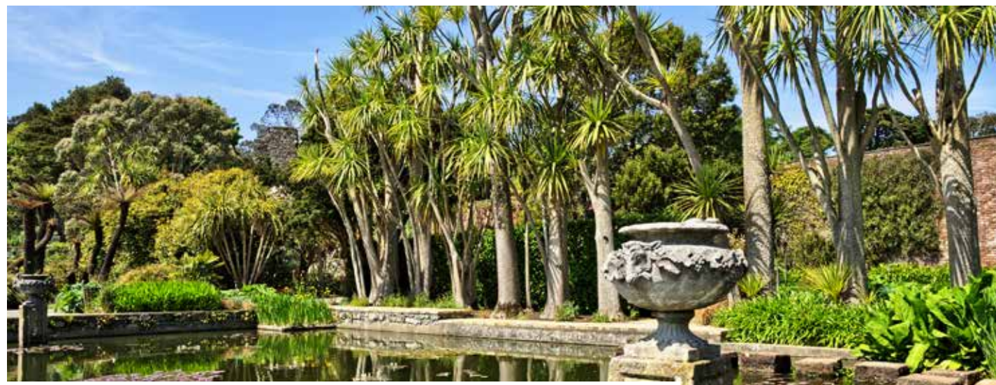
Logan Botanic Garden