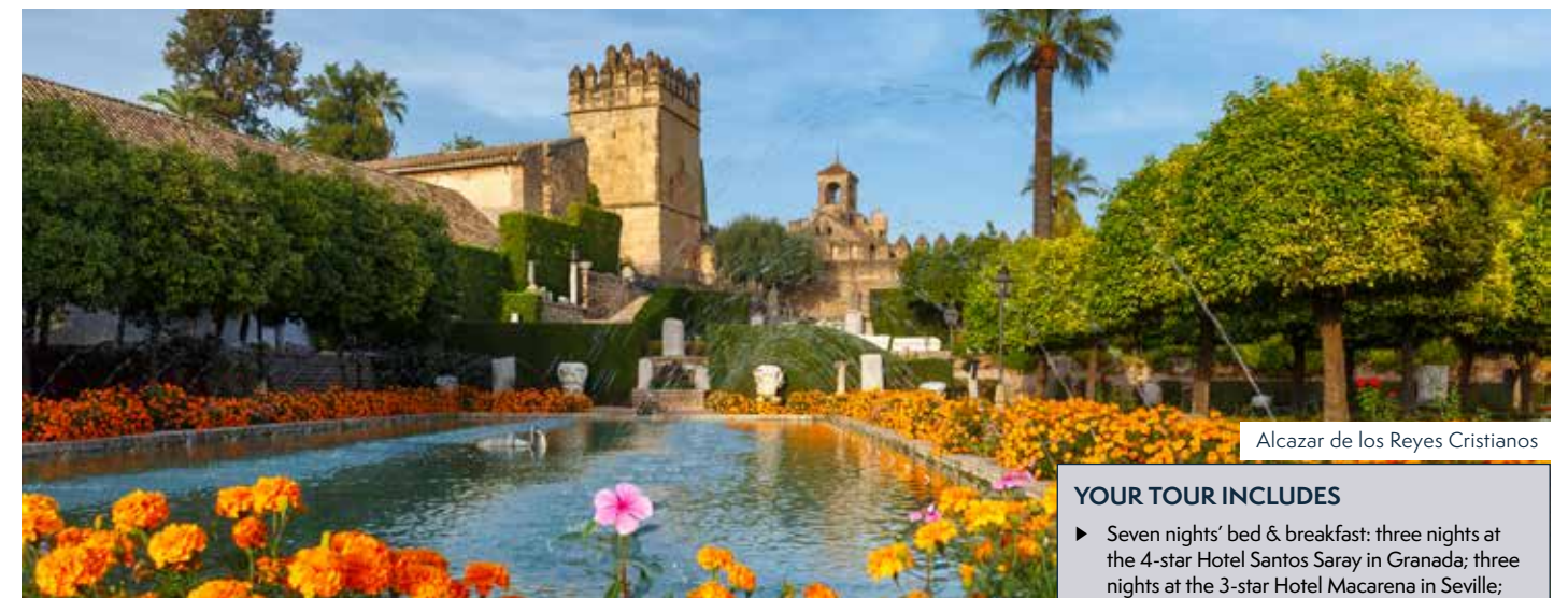
Alcazar de los Reyes Cristianos