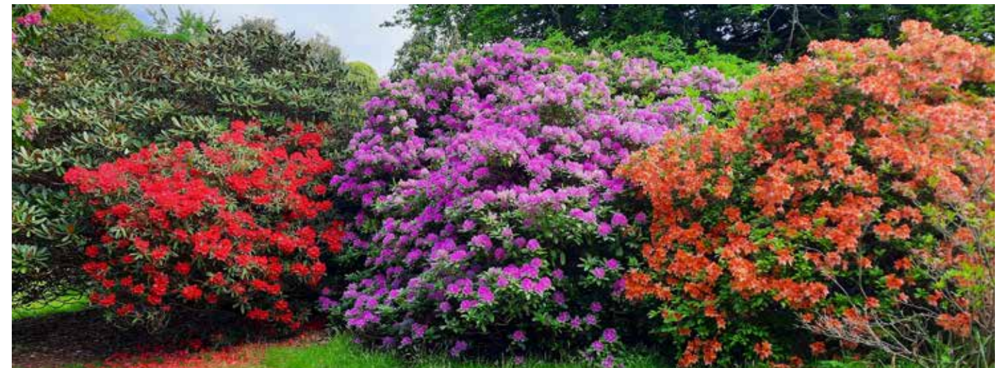
Castle Kennedy - Rhododendrons