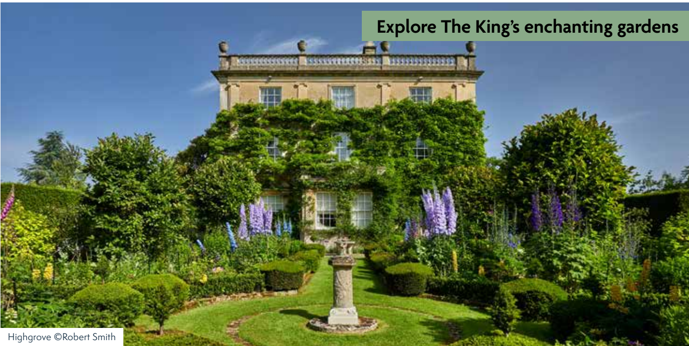
Highgrove