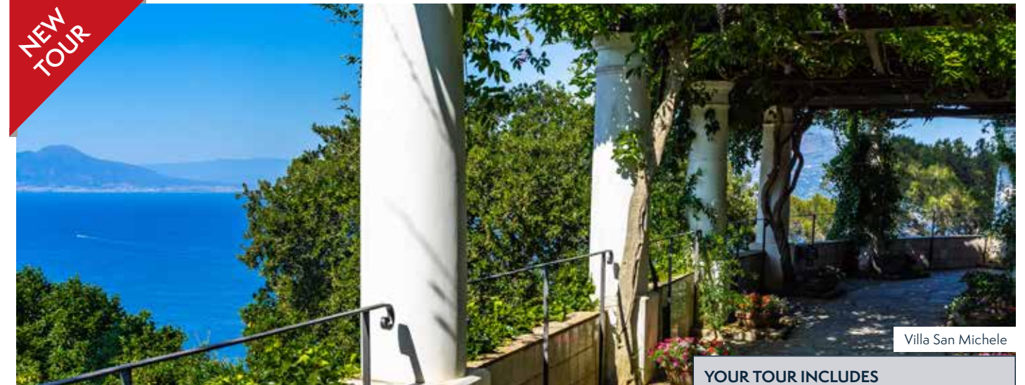
Villa San Michele