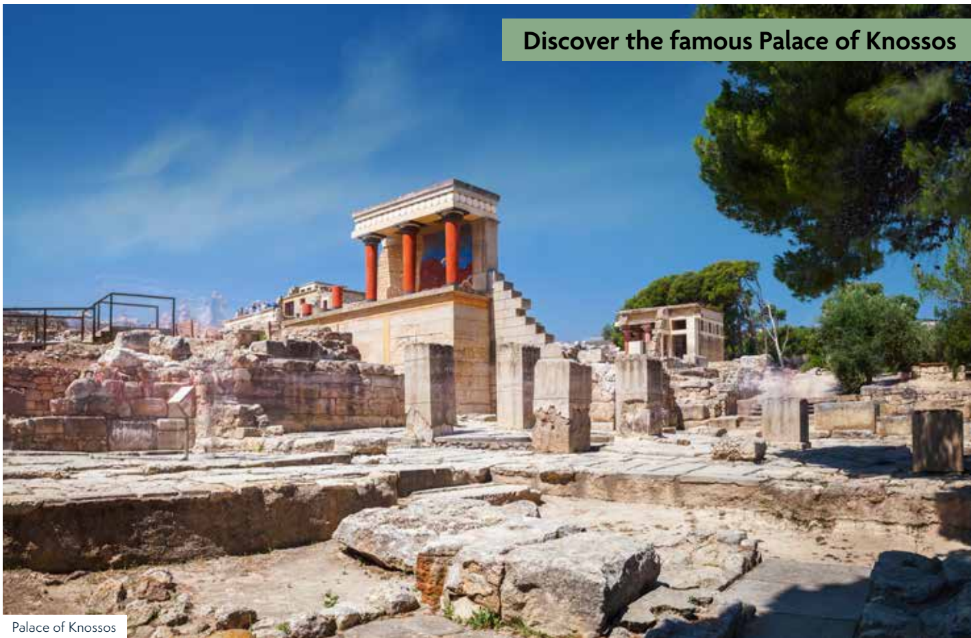
Palace of Knossos