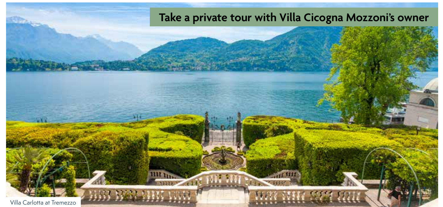
Villa Carlotta at Tremezzo

Take a private tour with Villa Cicogna Mozzoni's owner