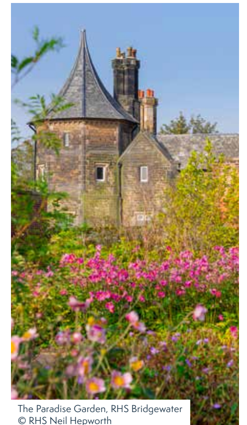
The Paradise Garden, RHS Bridgewater