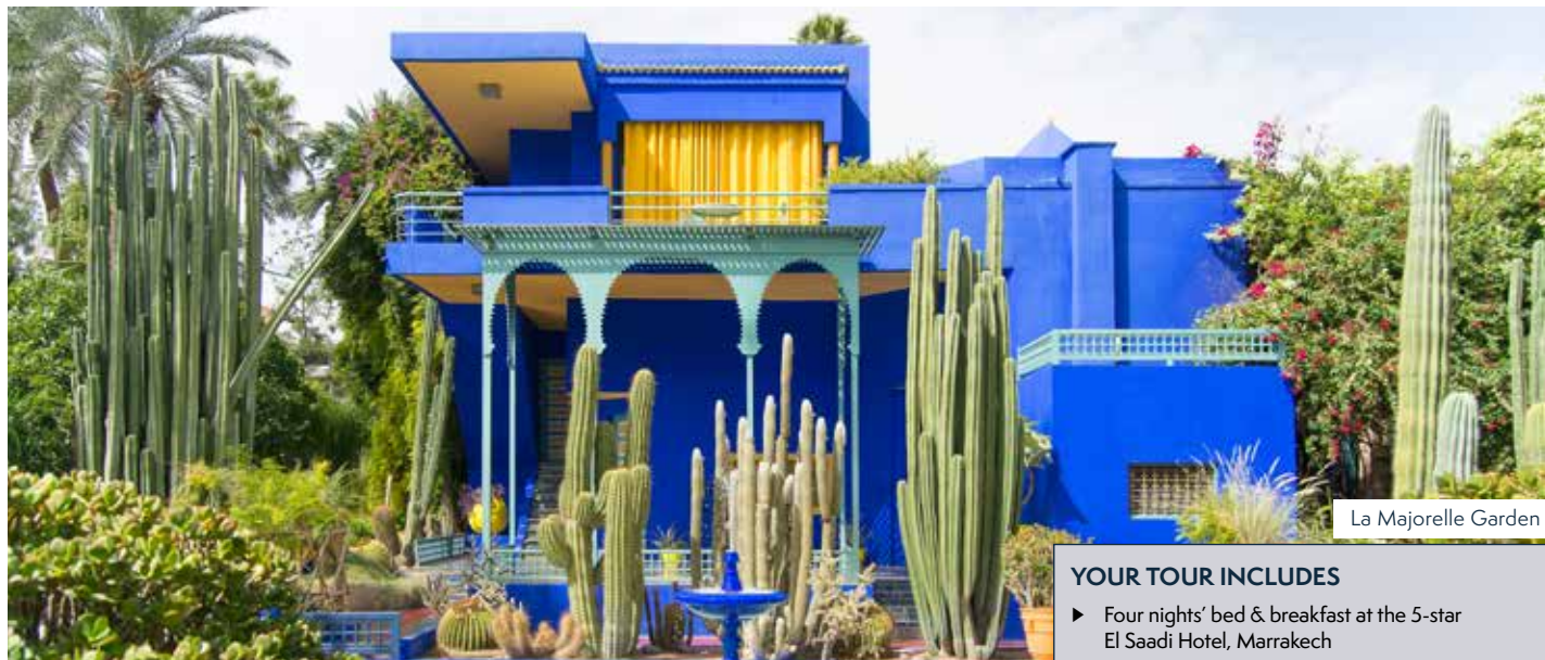
La Majorelle Garden