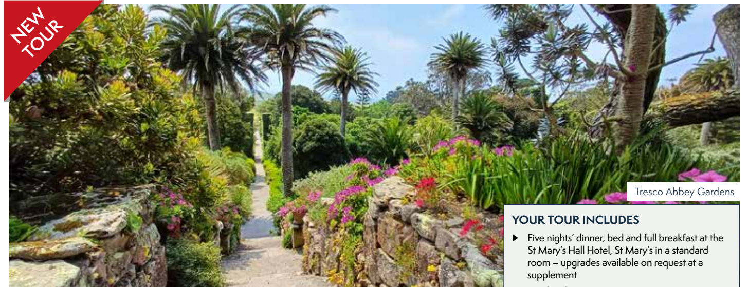
Tresco Abbey Gardens