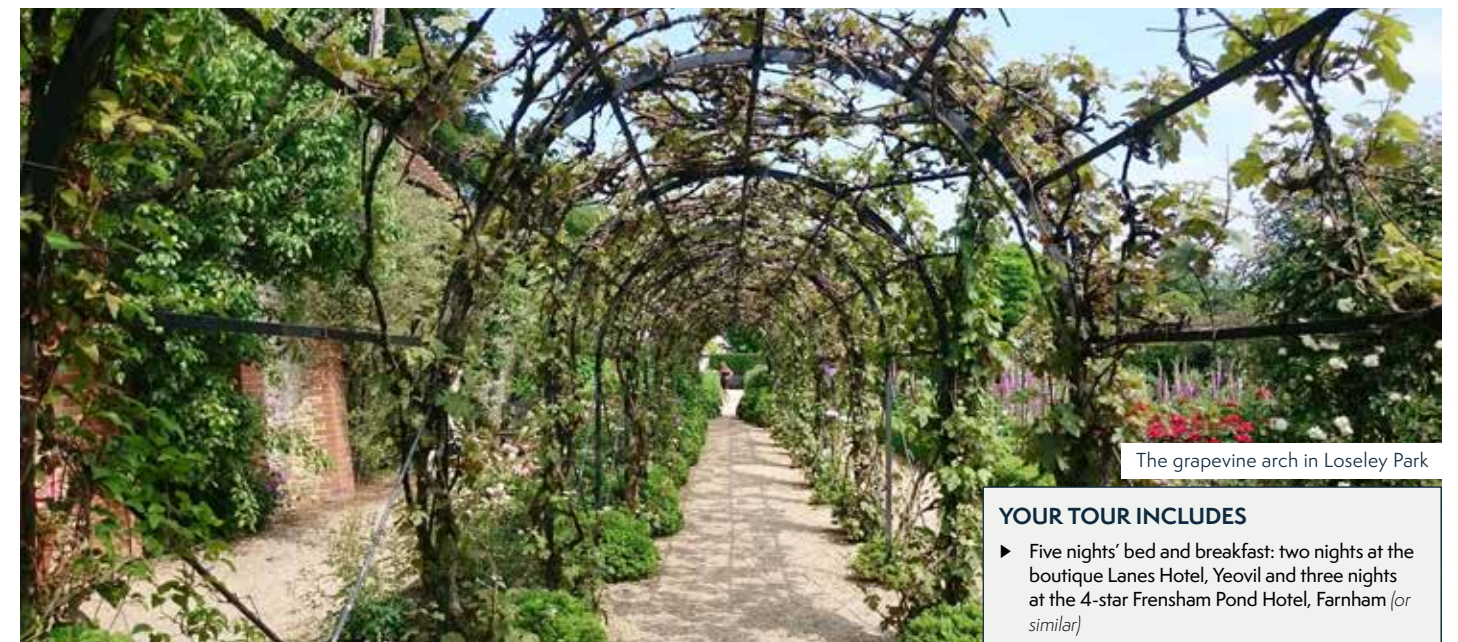
The grapevine arch in Loseley Park