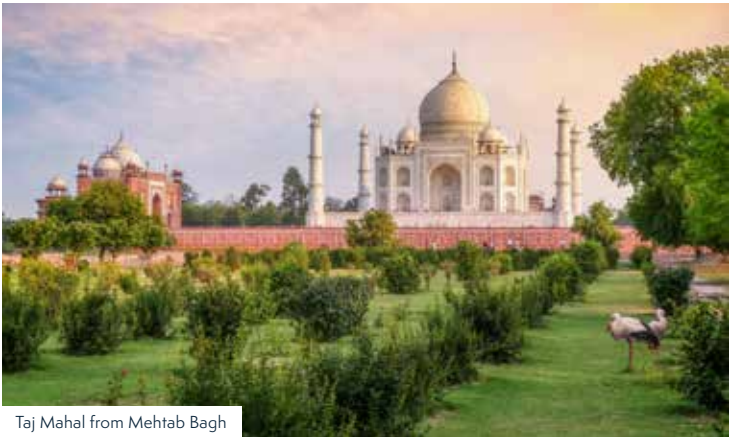
Taj Mahal from Mehtab Bagh