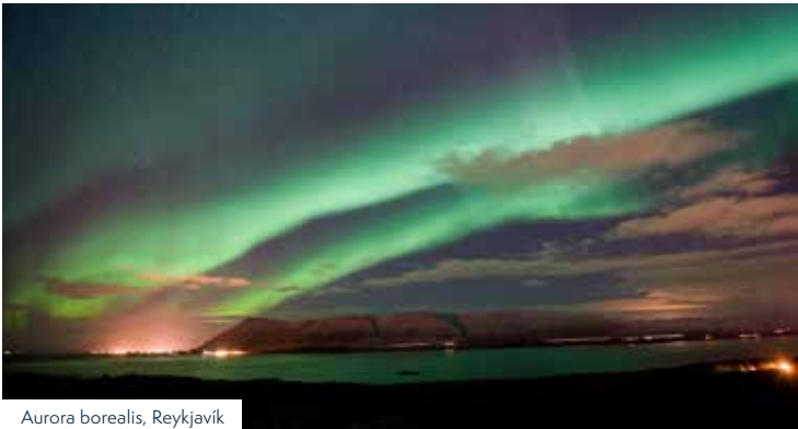
Aurora borealis, Reykjavík

Day 1 We depart from London to Reykjavík . Upon arrival, we visit the Raufarhólshellir Lava Tunnel , a unique experience exploring the inner workings of a volcanic eruption. From here we head to Eyrarbakki Village and then onto the Urriðafoss waterfall with its impressive volume of cascade in the whole of Iceland. We continue to our hotel. (D) Day 2 Our full-day tour of south Iceland includes Skógafoss waterfall and a visit to Skógar Folk Museum . We also have a wonderfully unique experience where we walk behind Seljalandsfoss waterfall and enjoy some stunning views of glaciers. (B, D) Day 3 The remote Skálholt church and Þingvellir National Park await, where the tectonic plates of Europe and North America meet. We also admire the Gullfoss waterfall and the Geysir Geothermal Area where we can see Strokkur erupt. (B, L, D) Day 4 We enjoy a city tour of Reykjavík then move on to the Icelandic parliament ' Alþingi ' which was founded in AD930 and is considered the oldest Parliament in the world. Next, we visit the panoramic viewing platform at the Perlan and the Aurora Reykjavík centre .