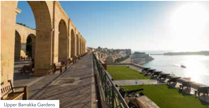
Upper Barrakka Gardens