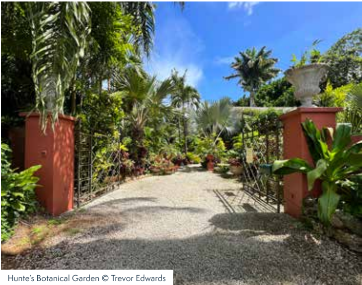
Hunte’s Botanical Garden