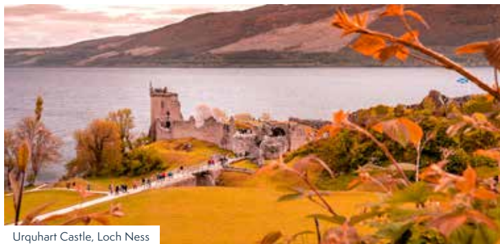
Urquhart Castle, Loch Ness

The MV Lord of the Glens, with its 27 beautifully appointed cabins, is the perfect vessel from which to enjoy the majesty of the Scottish highlands and islands. With all meals and shore excursions included the cruises offer excellent value, while providing a luxurious treat.