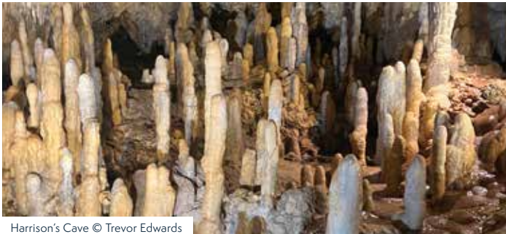
Harrison’s Cave © Trevor Edwards