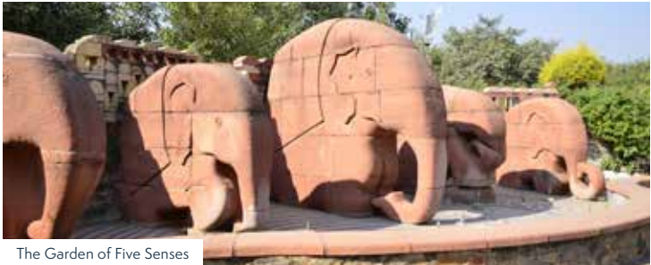
The Garden of Five Senses