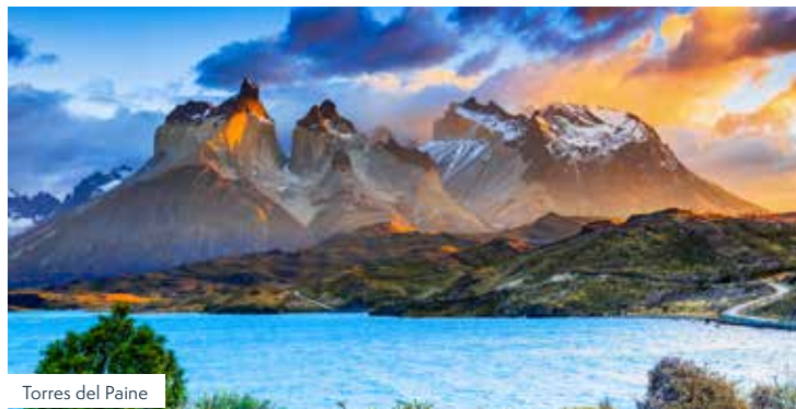
Torres del Paine