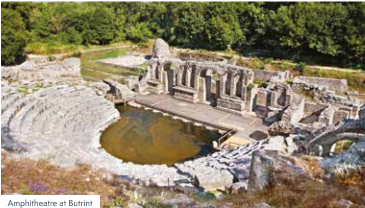
Amphitheatre at Butrint