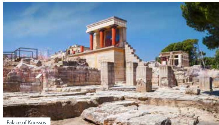
Palace of Knossos

Day 6 We have free time to explore the local area, or alternatively join our optional excursion to the Arkadi Monastery and Eleutherna Museum including lunch. (B)