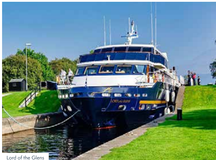
Lord of the Glens

Inc. meals: FB: Full Board, B: Breakfast, D: Dinner