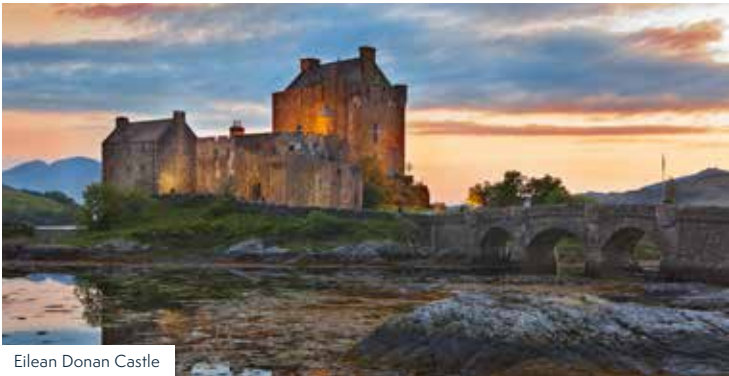
Eilean Donan Castle

Day 3 We depart once again by diesel train from Inverness, this time diverging at Dingwall and heading for Kyle of Lochalsh , travelling over what is often considered to be the most