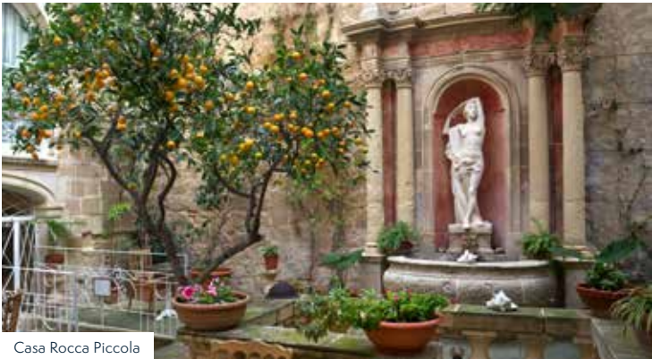
Casa Rocca Piccola

Day 1 We depart from London to Malta and upon arrival, we transfer to our comfortable 4-star hotel in St Paul's Bay, overlooking the sea. (D) Day 2 We spend a full day in Valletta , Malta's bustling capital city with its unique combination of architectural styles. We will enjoy views over the Grand Harbour from the Barrakka Gardens , admire the art works in St John's Co-Cathedral , one of the most spectacular in Europe, and visit the Casa Rocca Piccola , which gives an insight to the customs and traditions of the Maltese nobility over the last 400 years. We conclude at the Malta Experience , where a state-of-the-art presentation brings 7,000 years of history to life. (B, D) Day 3 Today is free to explore the island at your leisure, or join one of two optional excursions - a full day on the peaceful neighbouring island of Gozo , including visits to the prehistoric Ggantija Temples , the capital city of Victoria and the picturesque Bay of Xlendi , or a half-day touring the southern half of Malta, with visits to Vittoriosa , including a boat trip around the harbour, and the village of Marsaxlokk . (B, D)