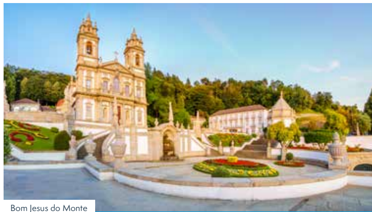
Bom Jesus do Monte

Day 7 A free day to explore Porto , or join our optional excursion – a boat trip on the River Douro , including lunch and free time to explore Regua. (B)