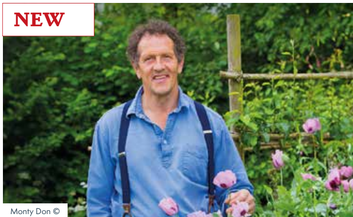
Monty Don

After a thrilling sellout tour in 2022, gardening guru Monty Don is heading back out on tour where he will share tales from his career in gardening, detail his favourite gardens - both ancient and modern - and reveal how he fell in love with the natural world. Discover how he created his beautiful garden at Longmeadow, the gardening practices he considers to be the most useful and important, and the magical impact of the changing of the seasons on each part of the garden.