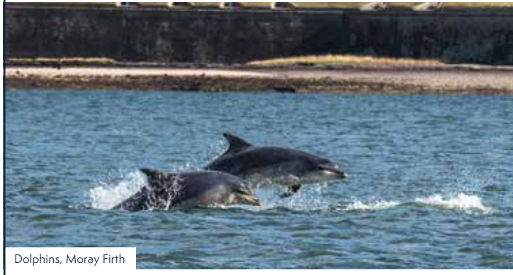
Dolphins, Moray Firth