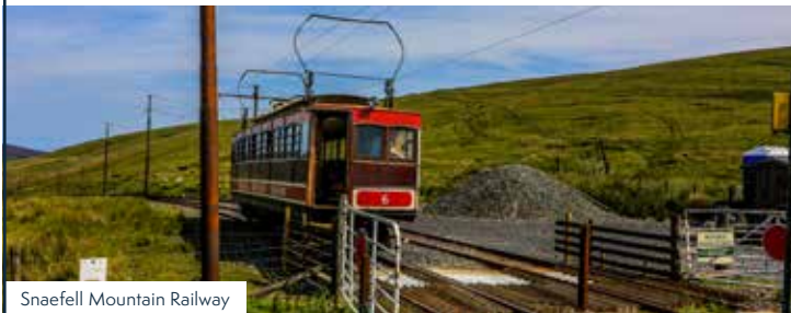
Snaefell Mountain Railway