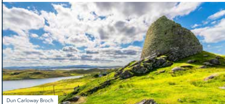
Dun Carloway Broch