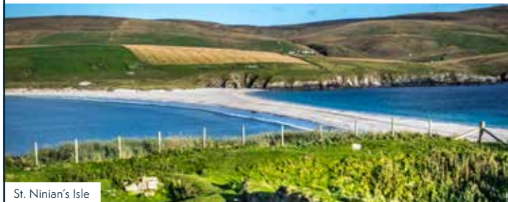
St. Ninian's Isle