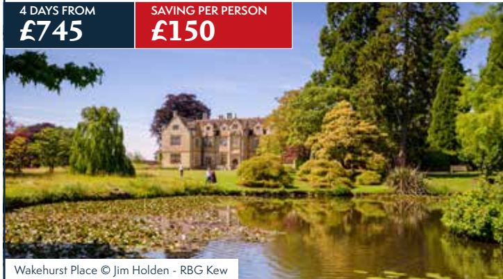
Wakehurst Place

If there's one tour that epitomises the joy of strolling around a perfect English country garden, it is this one – with one shining example after another to be savoured and enjoyed. Even if you have visited some of these properties before, such is their allure that you can return again and again, just as you would re-read your favourite novel. First-time visitors will be bowled over by the quality and pedigree of these gardens, which capture the essence of the English country garden. Visits include Great Comp, Lullingstone Castle and its World Garden of Plants, Nymans Garden, the Sussex Prairie Garden, Sissinghurst, Great Dixter and RHS Garden Wisley.