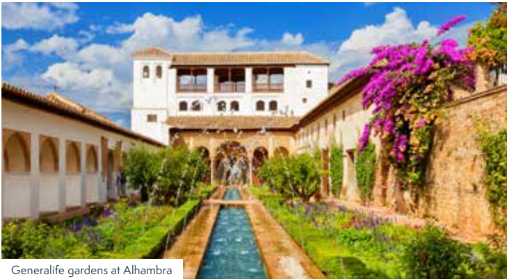
Generalife gardens at Alhambra