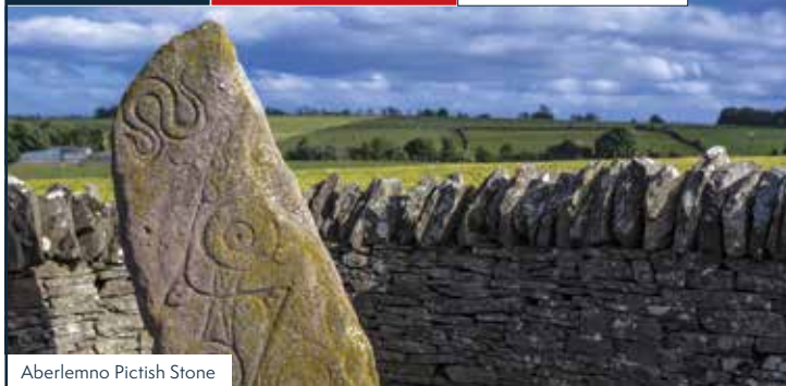
Aberlemno Pictish Stone

Living beyond the northern frontier of the Roman Empire, the people of northern Scotland in the Dark Ages were known as the Picts – a name given by the Romans meaning the 'painted, tattooed ones'. They were renowned as one of the most warlike of the Celtic barbarian tribes of Europe, successfully attacking the Roman army, and yet few of their homes or forts have ever been found. They did, however, leave behind some of the finest carved stones and jewellery from early medieval Europe.