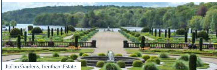
Italian Gardens, Trentham Estate