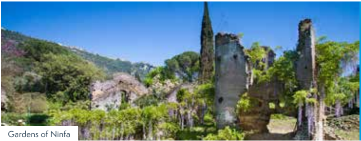
Gardens of Ninfa

Day 2 After breakfast we depart for Viterbo , where we have a guided tour. We’ll see a number of grand palaces and a host of old churches which are enclosed by an intact set of medieval walls. Nearby, we find the gardens of Villa Lante , described as “one of Italy’s greatest Renaissance gardens.” This study in geometry and symmetry dates back to 1568 when it was designed for Cardinal Gianfrancesco Gambara by the architect Giacomo Barozzi da Vignola. The dominant theme is water, and in front of the palazzina is a central water parterre, which is a classic example of late Renaissance or mannerist style. A later addition is the ornate French-style parterre de broderie, with intricate shapes in clipped box set against a ground cover of reddish gravel. [B]