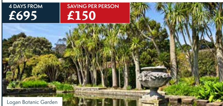
Logan Botanic Garden

In the south-western corner of Scotland, Dumfries and Galloway is home to some of the country's most attractive gardens. For many the highlight of our tour is undoubtedly Dumfries House, actually in Ayrshire, which King Charles helped to save. One of the Adam brothers' finest achievements, the stunning interiors showcase a unique collection of Chippendale furniture, while the walled garden is one of the most exciting new garden developments in Scotland. Other highlights include exotic plants at Logan Botanic Gardens, Glenwhan Gardens with its hilltop vistas and Drumlanrig Castle with its extensive gardens and world-class collection of fine art.