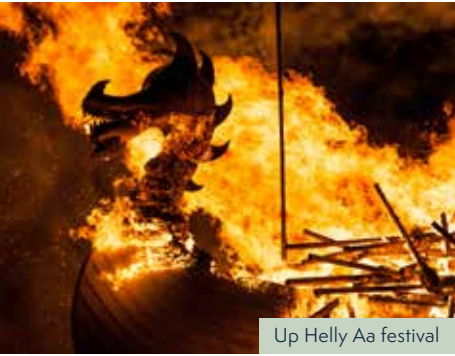
Up Helly Aa festival

squad is allowed to dress up as Vikings and are known as 'jarls', the Viking term for Earl. A procession of 1,000 men snakes its way through the streets carrying the superbly crafted galley which will then be ceremoniously burned. (B, D) Day 3 We set off for the northerly isles of Yell and Unst , travelling through Tingwall and Girlsta , and past the oil terminal at Sullom Voe . We head north to Baltasound and enjoy the views from Saxa Vord Hill . (B, D) Day 4 We depart on a tour of mainland Shetland, including visits to Scalloway and the Prehistoric and Norse Settlement of Jarlshof . We continue to Sumburgh Head , the southern tip of mainland Shetland. We then return to Sumburgh Airport in time for our return flight to Aberdeen. (B) Inc. meals: B: Breakfast, L: Lunch, D: Dinner