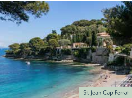
St. Jean Cap Ferrat