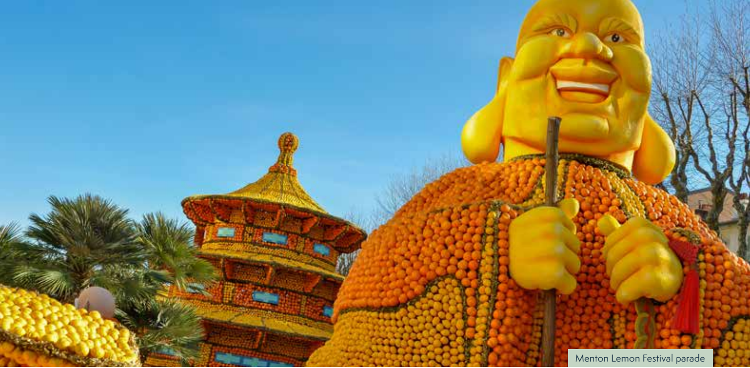
Menton Lemon Festival parade