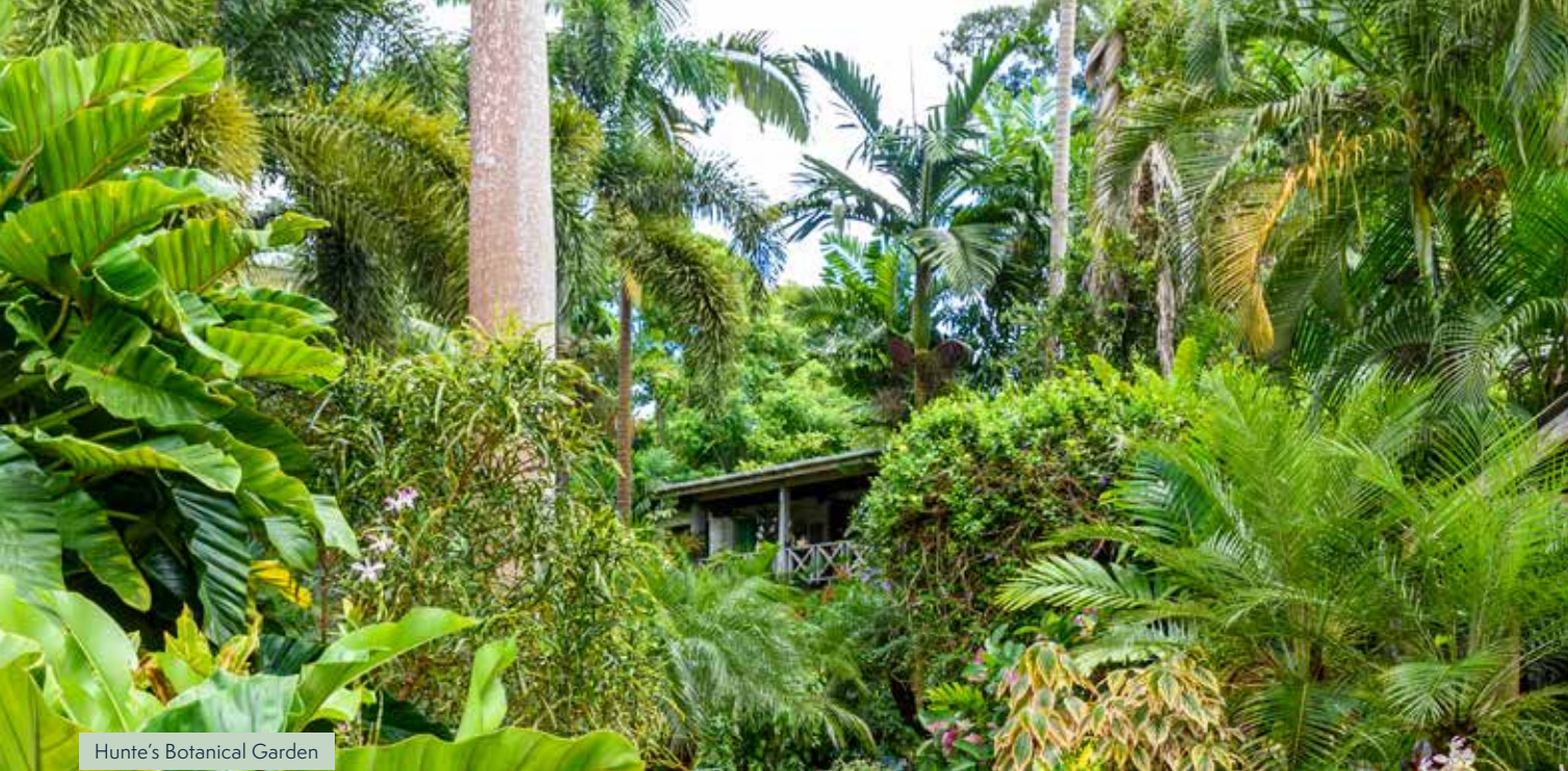
Hunte's Botanical Garden