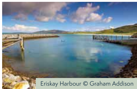
Eriskay Harbour

Inc. meals: B: Breakfast, L: Lunch, D: Dinner