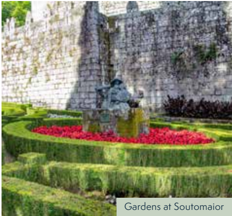
Gardens at Soutomaio

Inc. meals: B: Breakfast, L: Lunch, D: Dinner