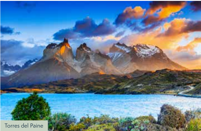
Torres del Paine

Returning favourites include the Caribbean gems of Barbados and Grenada; Costa Rica with its astonishingly diverse flora and fauna, and Seasonal Gardens of Japan, with its exquisite blend of ancient tradition and dazzling modernity. On the African continent we travel along South Africa’s Garden Route and go on safari in Tanzania, complimentary field guides in hand. Finally we fly to the Indian Ocean paradise island of Mauritius, and all the way to the other side of the world for our epic but endlessly rewarding tour of the Gardens of New Zealand. Take your pick and discover experiences you will never forget!