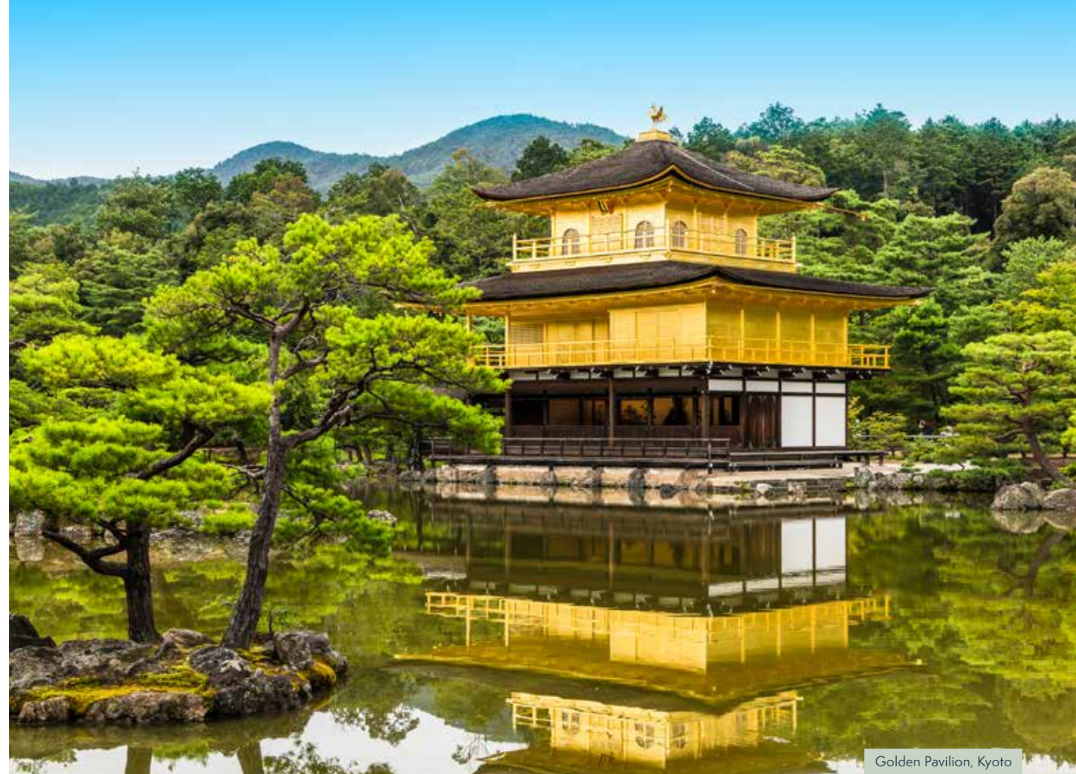
Golden Pavilion, Kyoto

Day 4 We journey to the Prefecture of Shiga . Beginning in Otsu , we visit the ancient temple of Ishiyamadera , which was established around the middle of the 8th century by Roben Osho. From here we continue along the shores of Lake Biwa-ko to the historic town of Omi Hachiman