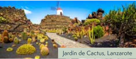
Jardín de Cactus, Lanzarote

which includes a demonstration of the island's unique whistled language Silbo Gomero . (B, L, D) Day 5 Continue to Gran Canaria with optional excursions to the Casa de Colon and the Bandama Caldera , and Teror and the garden of La Marquesa de Arucas . (B, L, D) Day 6 We cruise to Fuerteventura , with an optional excursion featuring goat's cheese and aloe vera . (B, L, D) Day 7 Today we reach Lanzarote and visit the Jardín de Cactus and The Green Heart of Haria , an oasis for wildlife with a vast collection of native plants. (B, L, D) Day 8 After breakfast, we transfer to Lanzarote airport for our return flight to London. (B) Inc. meals: B: Breakfast, L: Lunch, D: Dinner