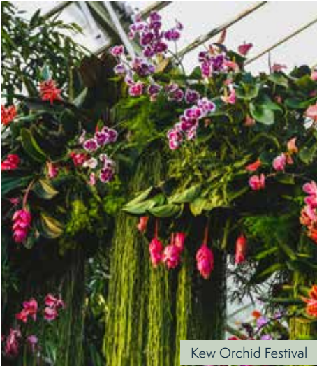
Kew Orchid Festival

hand-crafted by expert horticulturists. Later, we head to RHS Garden Wisley , where the highest standards of practical horticulture are deployed. We will also enjoy dinner in the elegant surroundings of this prestigious garden. (B, D) Day 3 We depart for the Savill Gardens in Windsor, one of Britain's greatest ornamental gardens where we enjoy a guided tour. We return to our original pick-up points. (B) Inc. meals: B: Breakfast, L: Lunch, D: Dinner