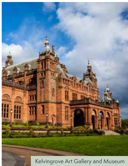
Kelvingrove Art Gallery and Museum

Inc. meals: B: Breakfast, L: Lunch, D: Dinner