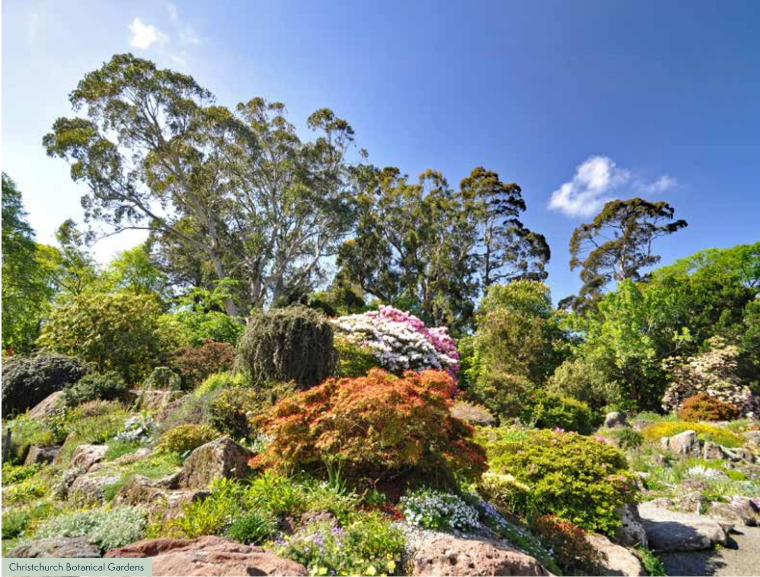
Christchurch Botanical Gardens

Hamilton Gardens en route. Tonight we are treated to a Maori cultural experience . (B, D) Day 6 We depart for New Plymouth this morning and upon our arrival, we visit Tikorangi . This large landscaped garden has one of the best plant collections in the country and has been rated as a Garden of National Significance. We also stop at the Te Rewa Rewa Bridge . (B, D) Day 7 Following breakfast we take a sightseeing tour of New Plymouth , featuring the gardens and beaches of this unique city. Visits include Te Kainga Marire , Holland Garden , Tupare and Pukeiti Garden . (B) Day 8 Transfer to Wellington , stopping en route at the Paloma Gardens in Wanganui, which has four distinct areas. (B, D) Day 9 Our day starts with an informative sightseeing tour of the city, including the Parliament Buildings , Old St Paul's Cathedral , the Botanical Gardens , Victoria University and the views from Kelburn . We continue to Otari , or Wilton's Bush, New Zealand's only native botanic garden, devoted solely to the cultivation and preservation of indigenous plants. Later today, we visit the Zealandia Ecosanctuary , home to over 225 hectares of regenerating native forest and 40 species of birds. The rest of the afternoon is at