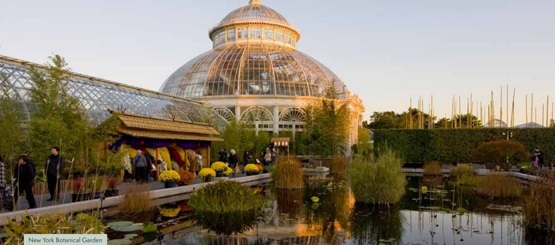
New York Botanical Garden